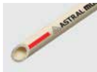
MULTIPRO COMPOSITE PIPE (3 METRE LENGTH)